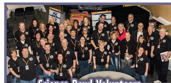
Science Bowl Volunteers