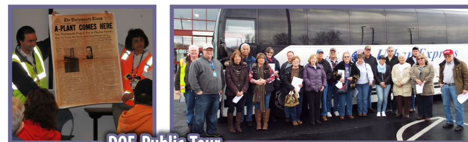
DOE Public Tour