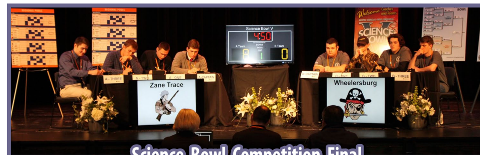
Science Bowl Competition Final